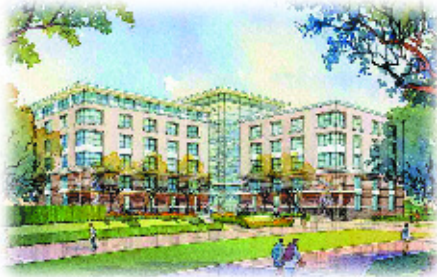
Bren Hall. Projected completion: January 2006

As of March 2005, 13 design and construction projects , estimated at approximately $411 million, were in progress at the Irvine campus. Another $372 million in construction projects were under way at the medical center.